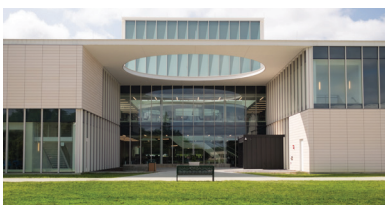
Michael J. Grant Campus Learning Resource Center (LRC)