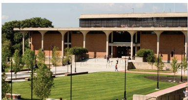
Ammerman Campus Huntington Library