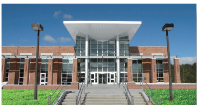
Eastern Campus Montaukett Learning Resource Center (MLRC)