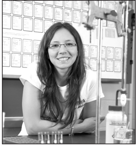
SCCC has a long history of producing award-winning science students.

American Sign Language Studies – A.A.S. Chemical Dependency Counseling – A.A.S. Criminal Justice – A.S. Dietetic Technician – A.A.S. Emergency Medical Technician: Paramedic – A.A.S. Fire Investigation – Cert. Fire Protection Technology – A.A.S. Fitness Specialist – A.S. Health Information Technology/Medical Records – A.A.S. Human Services – A.S. Nursing – A.S. Occupational Therapy Assistant – A.A.S. Physical Therapist Assistant – A.A.S. Practical Nursing – Cert. Veterinary Science Technology – A.A.S.