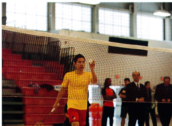
This summer's badminton tournament at Suffolk County Community College won't be your average backyard match.