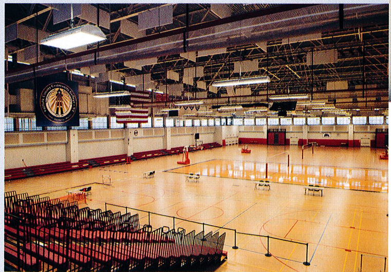
Suffolk County Community College's Brentwood Campus features a multi-facility field house where the international badminton tournament will take place.

The 57,800 square foot Michael J. Grant Campus Field House opened in 2000, can seat 4,800 spectators for exhibits and conventions and 2,700 spectators for sporting events, and is the largest facility of its kind in Suffolk County. The facility has a 200-meter, six-lane track, synthetic sports flooring (with the exception of a hardwood basketball court area); fitness center, dance/aerobics room, and a six-lane 250-meter pool with diving area and training room. — Drew Biondo