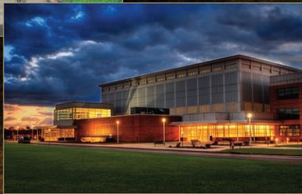
Health, Sports and Education Center Michael J. Grant Campus, Brentwood, NY