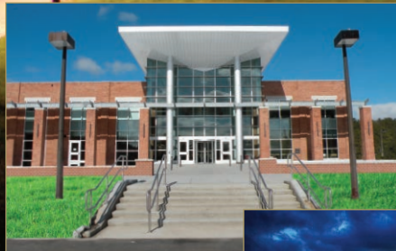
Montaukett Learning Resource Center Eastern Campus, Riverhead, NY

With campuses in Brentwood, Selden and Riverhead – and downtown centers in Sayville and Riverhead – we make it more convenient to achieve the future that you deserve. That's in addition to flexible scheduling options that give you the choice of classes in the early mornings, weekends or online.